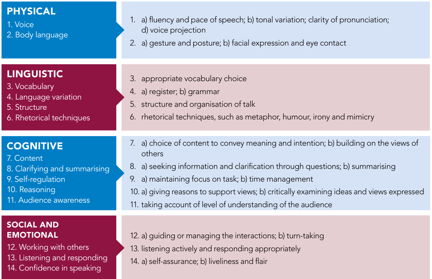
Figure 2. The Cambridge Oracy Skills Framework 13