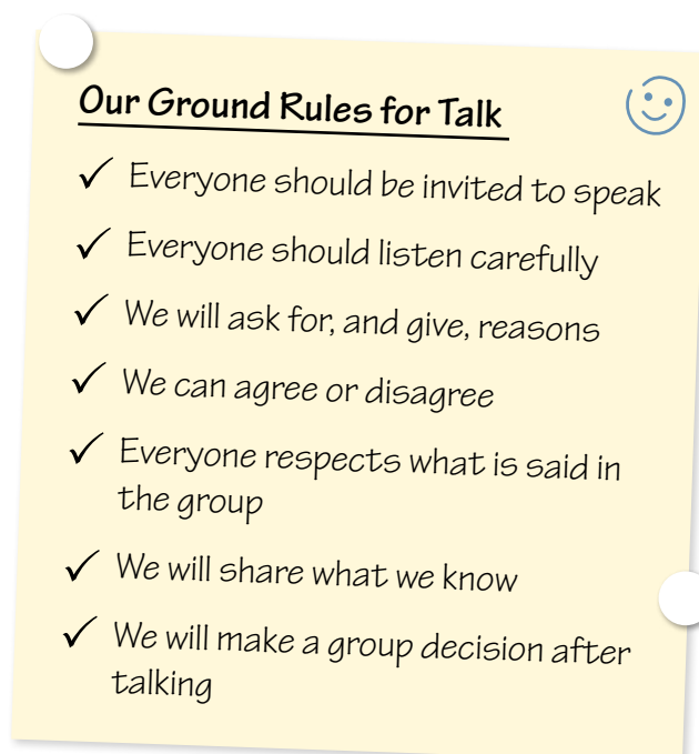
Figure 3. Ground Rules for Exploratory Talk

Figure 3 is a set of Ground rules for Exploratory Talk which a teacher agreed with her class 23 .